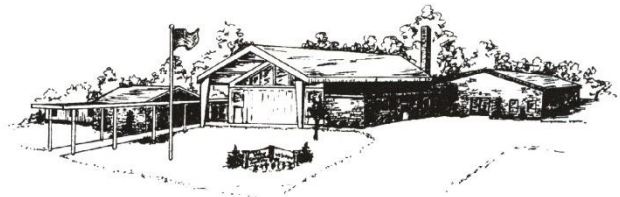
Valley Christian Academy Aurora, Ohio